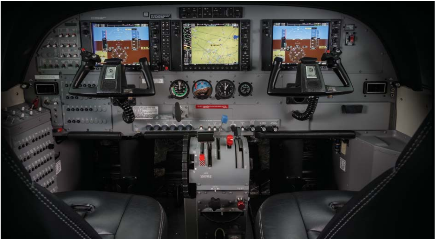
FIGURE III — GRAND CARAVAN EX INSTRUMENT PANEL AND PEDESTAL LAYOUT