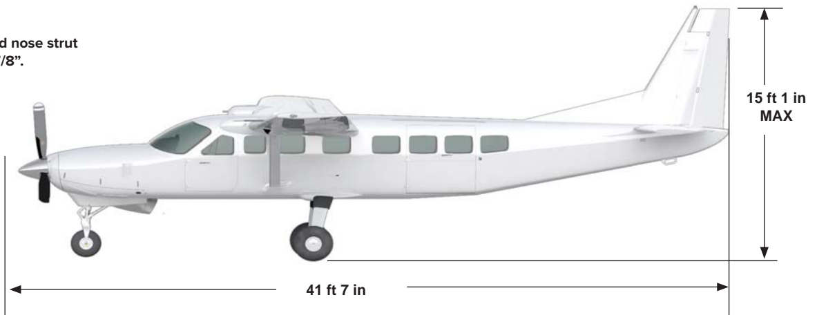
FIGURE I — GRAND CARAVAN EX EXTERIOR DIMENSIONS

(Shown with Optional Cargo Pod Installed)